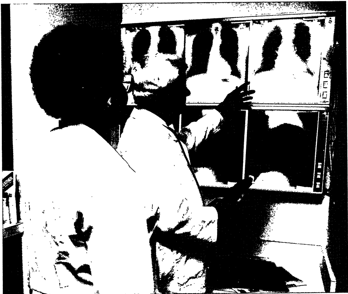
Duke University Medical Center

North Carolina Area Health Education Centers, C.B. Box 7165, Wing C, School of Medicine, University of North Carolina at Chapel Hill, Chapel Hill, N.C. 27599 (919) 966-2461. Improves geographic distribution and retention of well-trained health professionals and support personnel to meet the primary medical needs of the people of North Carolina.